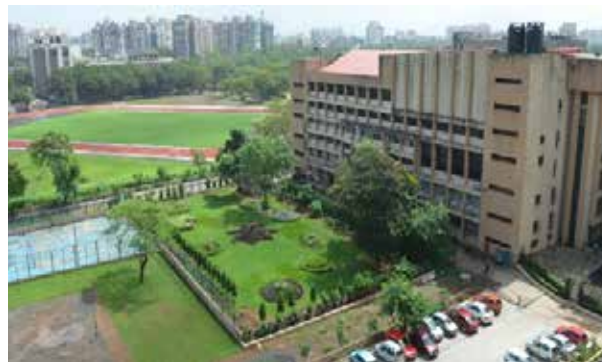
Smt Sakarben Karamshi Somaiya Sabhagruh, Somaiya Vidyavihar

“When we talk about health and fitness, we cannot put the mind aside. The wellness of physical health is very much dependent on the clarity and intelligence of the mind”