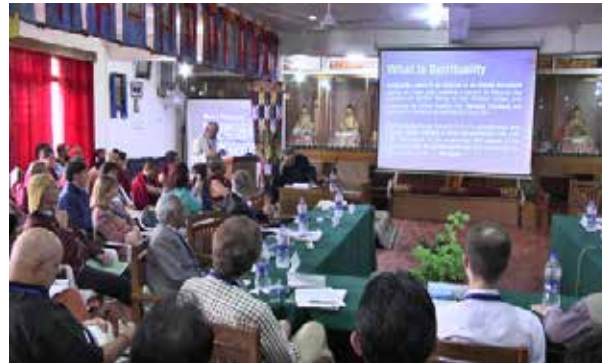
A session in progress during the 2 nd BML Conference, 2014.